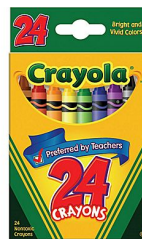
1 box crayons (16 or 24 count)