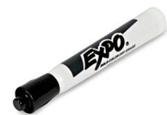
2 Expo markers (any color)