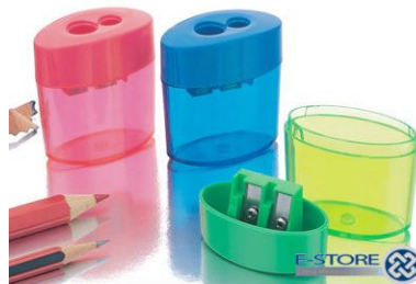
1 small pencil sharpener