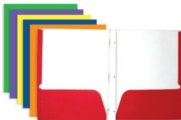
5 pocket folders (no brads, any color, 3-hole punched)